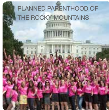
PLANNED PARENTHOOD OF THE ROCKY MOUNTAINS

PLANNED PARENTHOOD OF THE ROCKY MOUNTAINS $98,170