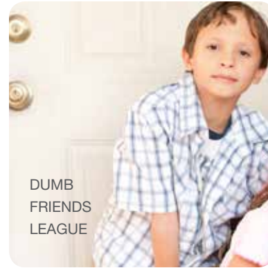
DUMB FRIENDS LEAGUE