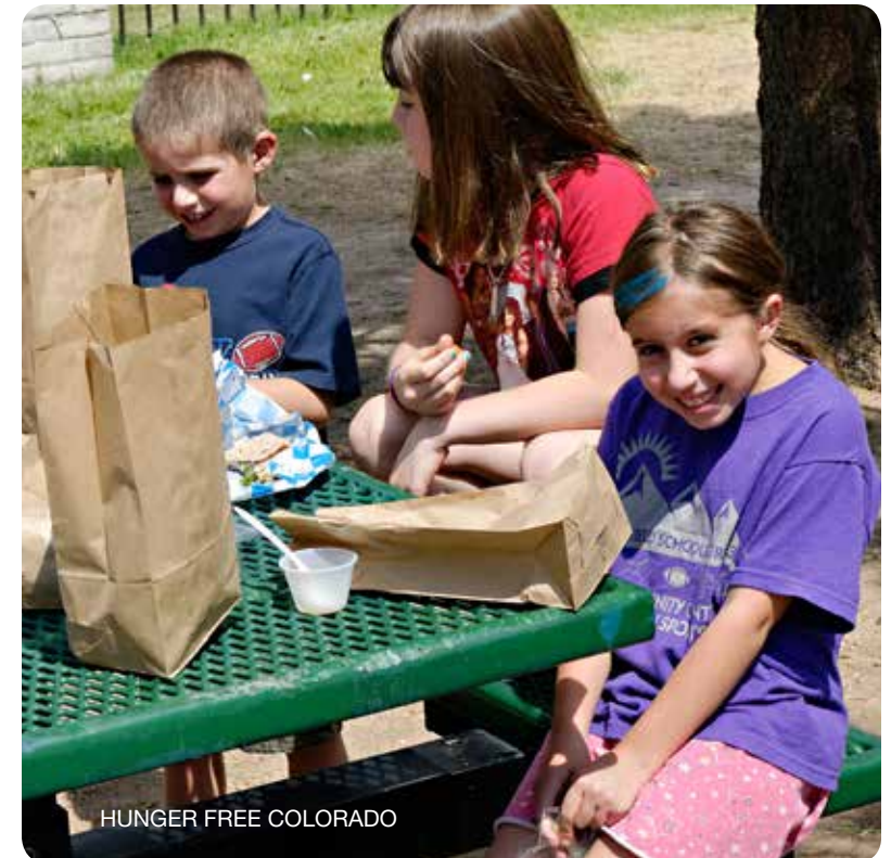
HUNGER FREE COLORADO

Community Shares of Colorado receives the majority of its revenue from two sources: annual givers and earned revenue. The majority of donors listed on this page make annual donations to Community Shares through workplace giving campaigns or recurring monthly donations. Unlike many foundations or giving funds, Community Shares does not receive the majority of its revenue from a handful of major donors. Instead, we work diligently throughout the year to engage our community of “everyday philanthropists” in incremental giving campaigns. We are committed to building community from the ground up and welcoming all who wish to give.