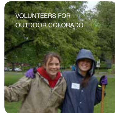
VOLUNTEERS FOR OUTDOOR COLORADO

Technical Assistance: By requiring each member agency to adhere to Member Excellence Standards and passing a painstaking recertification process each year, we provide extensive governance evaluation and technical support. We provide trainings on marketing and fundraising that not only ensure success in workplace giving campaigns but also give members tools to hone their entire organizational marketing and branding strategy. Finally, through our Seminar Series, we offer free professional development trainings on a diverse array of nonprofit topics, including fundraising, volunteer management, marketing and PR, and board development. By offering professional development to multiple individuals of each organization, we bolster the capacity of entire teams of professionals that serve our community.