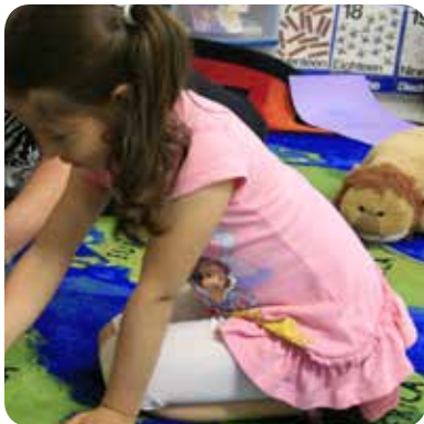
CHILDREN'S OUTREACH PROJECT