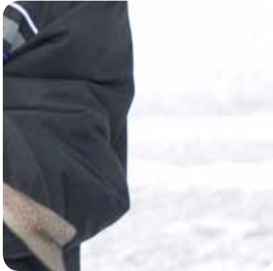
ENVIRONMENTAL LEARNING FOR KIDS