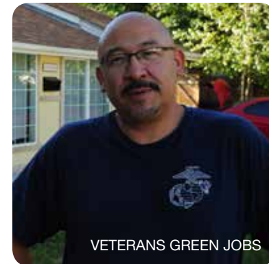
VETERANS GREEN JOBS