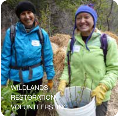
WILDLANDS RESTORATION VOLUNTEERS, INC

More than a decade ago, twenty people gathered to plant willows around Heron Pond at Pella Crossing, Colorado. From this humble beginning grew Wildlands Restoration Volunteers, a corps of thousands of dedicated volunteers with formal leadership training as well as a diverse youth program, who donate roughly $1 million worth of labor and expertise in restoring over 60 locations in Colorado's Front Range each year.