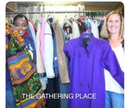
THE GATHERING PLACE

Invested in The Delores Project brings stability to a woman or transgender individual experiencing homelessness by providing access to strengths-based services and shelter.