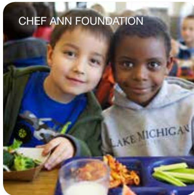
CHEF ANN FOUNDATION

Vibrant shades of reds, oranges, and yellows found on Colorado Aspen trees during the fall season often remind residents and visitors alike of change and that snowy weather will soon be approaching. It's during this season that we also see our nationally-known farmer's markets overflowing with locally farmed fruits and vegetables that we are so lucky to have at the tip of our fingers, allowing for healthier diet choices in our lunchrooms and on our dinner tables.