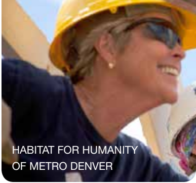
HABITAT FOR HUMANITY OF METRO DENVER