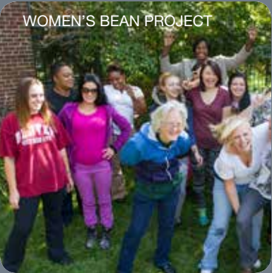
WOMEN'S BEAN PROJECT

$1 a day invested in Women's Bean Project can give a woman a chance to change her life by eliminating barriers toward her path of personal and economic self-sufficiency by allowing her to gain skills and self-confidence.